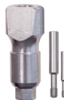
Open/Closed Tray Imp. Coping