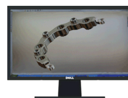
ERA Cad-Cam Bar*

Call or visit our website for more information and meaningful insights from dentists who have found they get the best outcomes from using the ERA System.