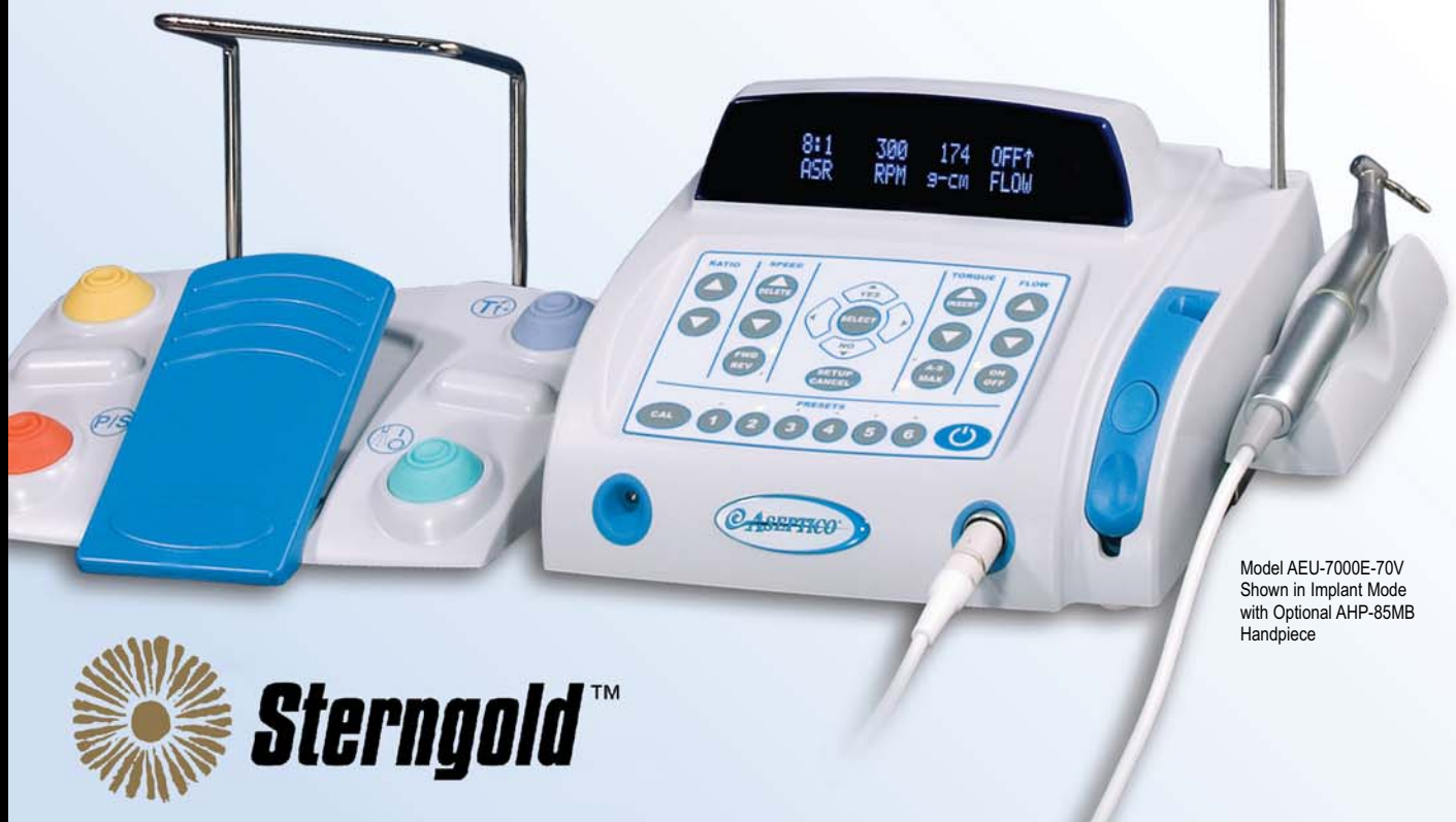
Model AEU-7000E-70V Shown in Implant Mode with Optional AHP-85MB Handpiece